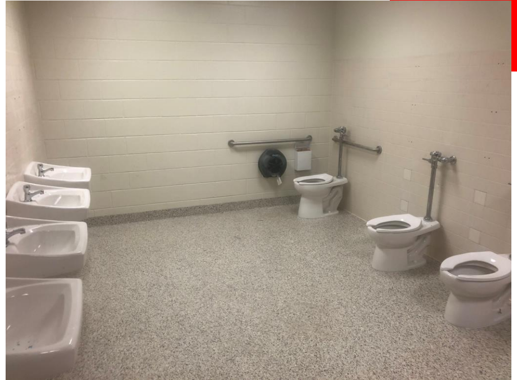
New Plumbing Fixtures and epoxy installed in Group Restrooms in 8 th Street