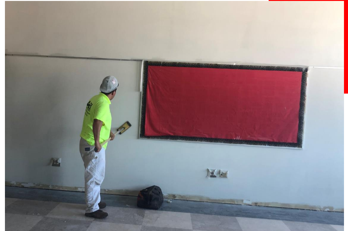
Painting 8 th Street Classrooms