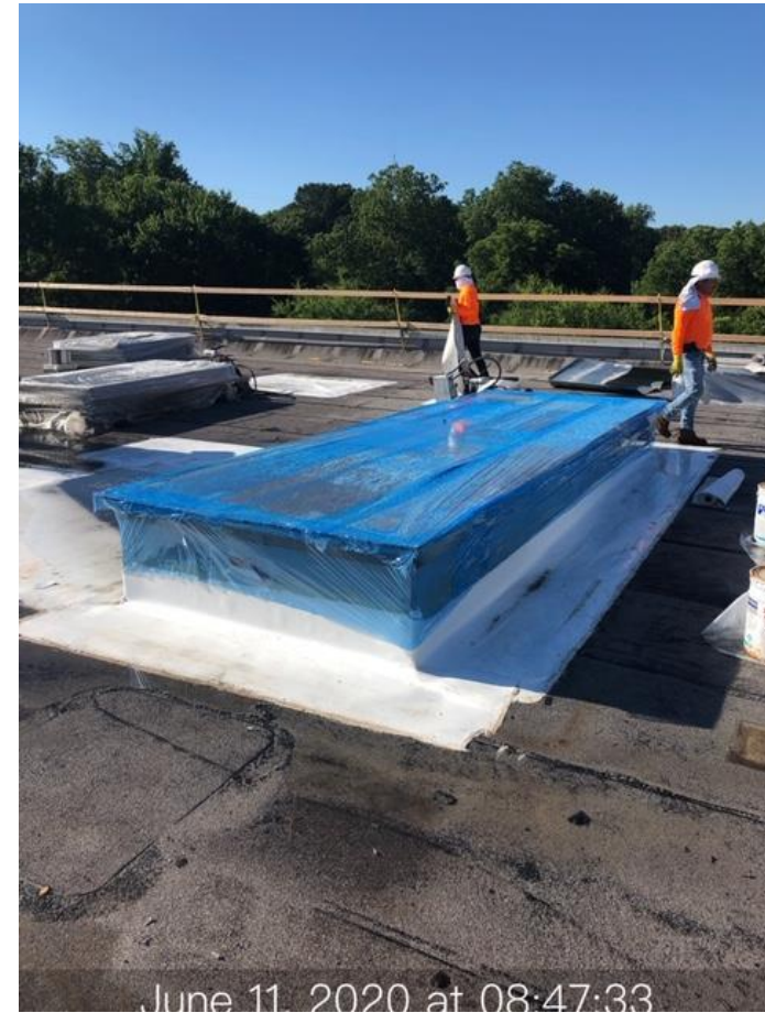
Installing HVAC Curbs on 8 th Street building